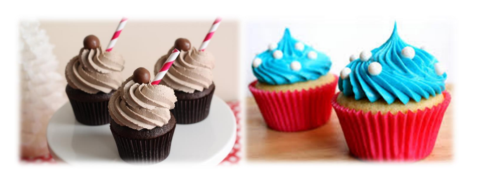
Cake prices range from 30p to £1